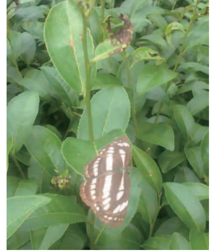
Our old man Dong Ding is ecologically conscious, organic and thrumming with life. When a farmer stops thinking in terms of weight, Nature will always provide tea. Most insects will not decimate a tea garden if the tea trees have grown strong on their own, rather than through the use of fertilizers. Also, insects attract birds and other predators that balance the ecology over time.

Unfortunately, the region temporarily lost its way when lighter oxidation, unroasted oolongs came into fashion in the 1980's, and many traditional processes were cast aside in favor of the prospect of higher profits. In an attempt to compete with the success of nearby San Lin Xi high mountain oolongs, the farmers of Lugu abandoned traditional processes, and many lost the knowledge and skills behind traditional oolong roasting entirely as a new generation of farmers took over. Perhaps even worse yet, the loss of traditional processing methods coincided with a switch to conventional farming. Realizing that they couldn't compete with the aroma of high mountain oolong (which is, by the way, the best thing high mountain oolong has going for it!), they began to pump their plants full of fertilizers in an attempt to increase their profit margins by drastically increas-