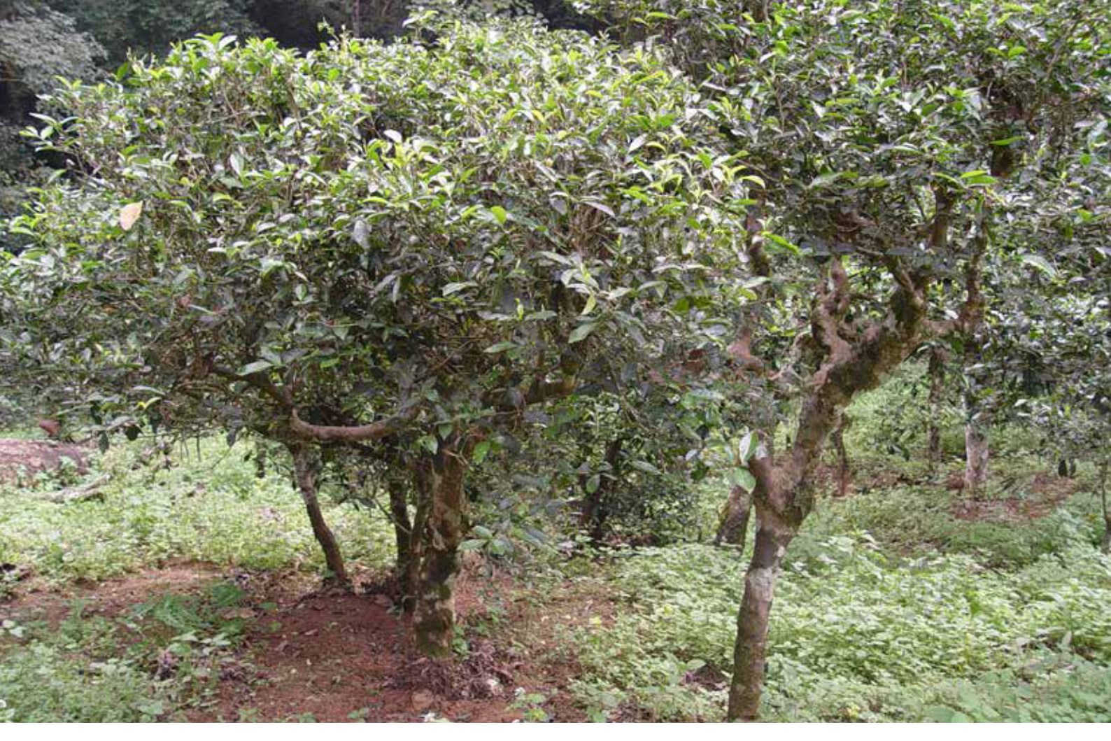
Wild, old-growth tea trees in Yunnan

from the Heavens above, bringing "Cosmic Vitality" (yang) down into the energy of the Earth (yin). This philosophy forms the basis of the ancient teachings of Daoist Geomancy (Feng Shui), which situated hundreds of the most famous and beautiful monasteries and hermitages in ancient China. And, so it is said, Yunnan has more Dragon Veins than anywhere on earth! With such an environment as its birthplace, it is no wonder that tea developed into such a powerful, rich plant.