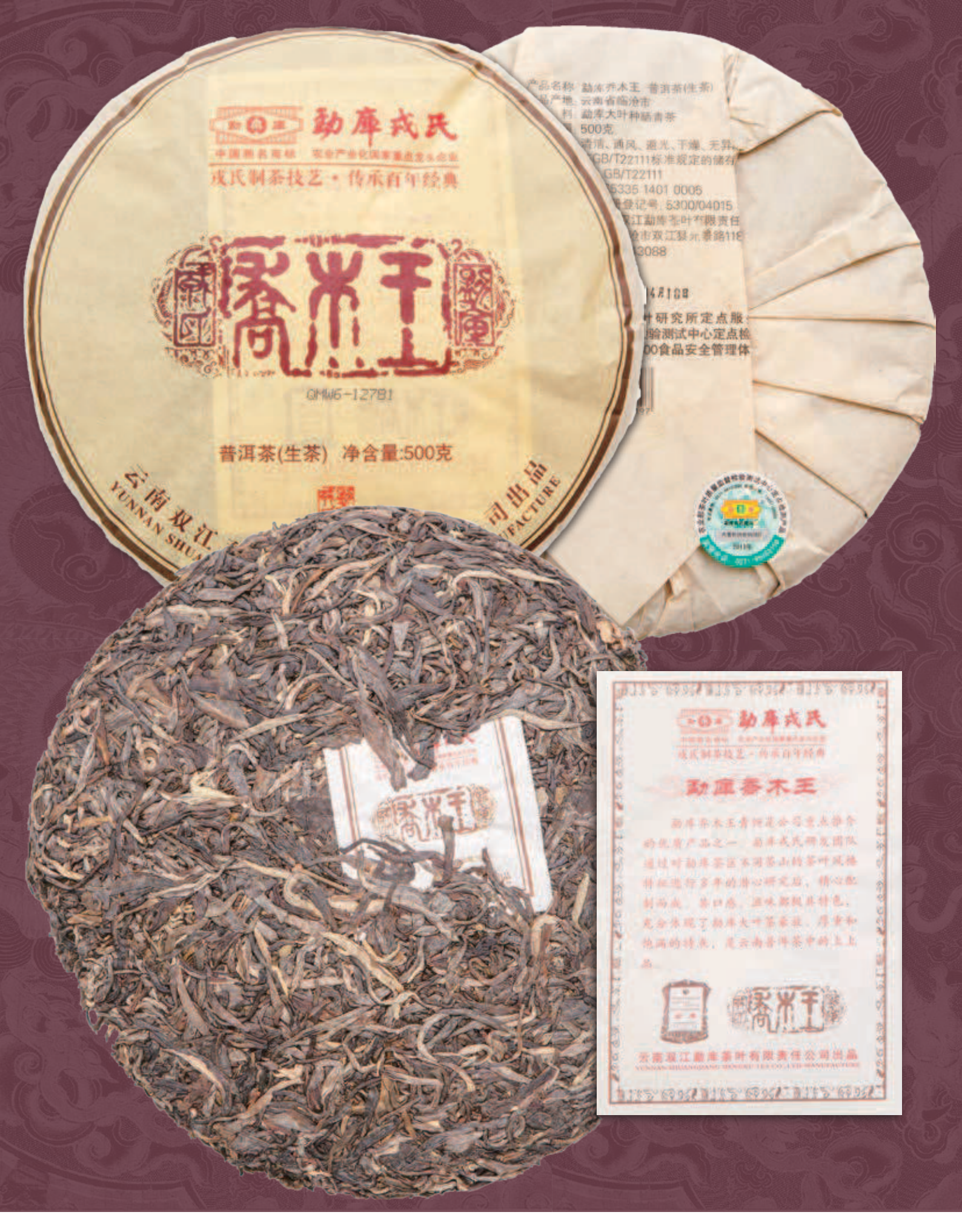
Our tea of the month: front and back wrapper, inner receipt and the cake. Notice the organic certification sticker on the back.