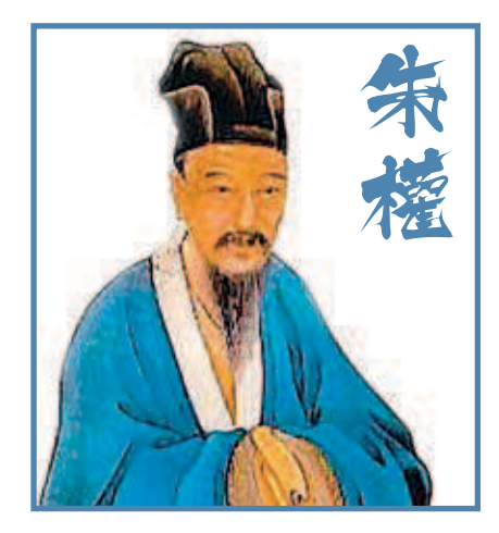
A Zhu Quan; artist unknown.

Any kind of fragrant flowers is suitable to make scented tea, the best of which exudes but a hint of some favorable aroma. Pick the flowers when they are in bloom. Make a two-tiered bamboo lantern and place the flowers into the lower section while the tea leaves rest on the upper section. Seal the lantern tightly and let it sit overnight. On the following day, open the lantern and replenish the bottom with freshly-picked flowers. Repeat this procedure for several days, until the tea leaves absorb the lovely fragrance of the flowers. It is also possible to employ this technique with borneol instead of flowers.<sup>10</sup>