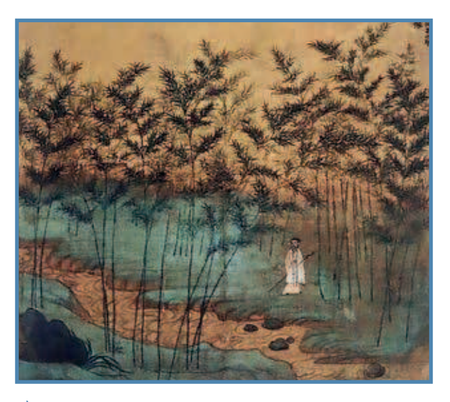
Song Dynasty painting of a sage wandering in search of clear mountain water by Zhao Mengfu in 1299.

For running water, it is better to gather water from rivers that are far away from civilization. The large pond with many rocks near Nanling, filled by the Yangtze River, is a top choice. Waters that rise from underground caves should sit for some time. One should wait until the unfavorable particles have left the water before drinking. To